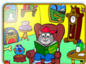
Bailey's Book House

Simply click on the Go! button next to each of the colourful icons below to launch the application.