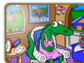
Trudy's Time & Place House

In addition to these applications for young learners, the following learning resources are available for each subject area: