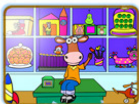
Millie's Math House